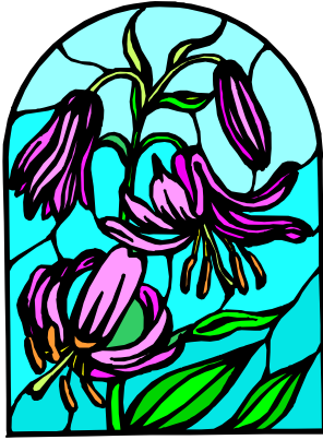
Lilium martagon l.